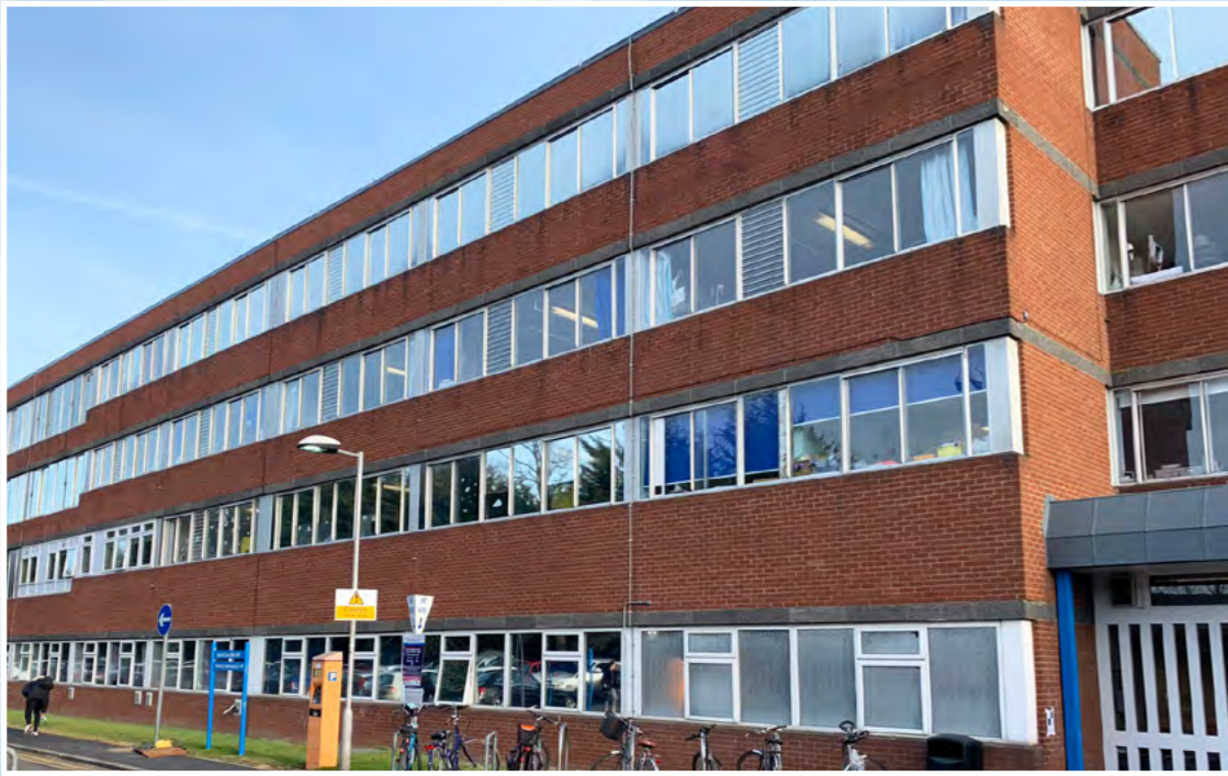
York Hospital, Main Ward Block