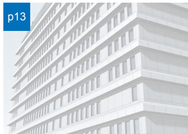
Gloucestershire Royal Hospital