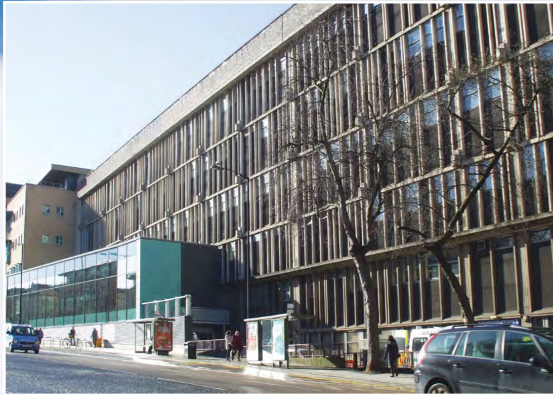
Bristol Royal Infirmary, Queen's Building