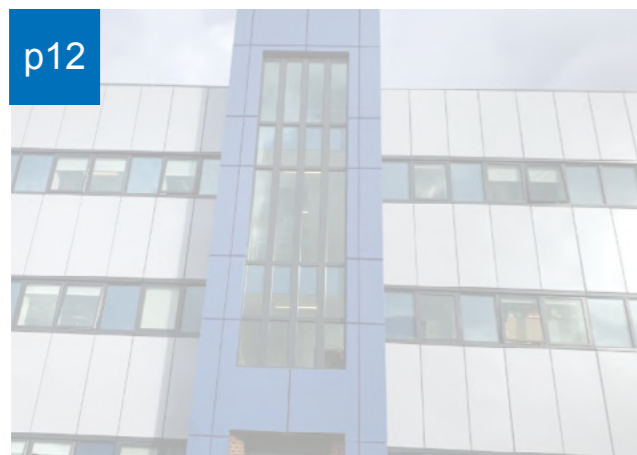
Eastbourne District General Hospital