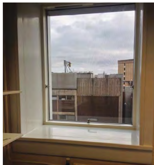
The final solution met the architectural intent that "Veil" should have no visible windows whilst meeting the performance requirement of transmittance of light internally.