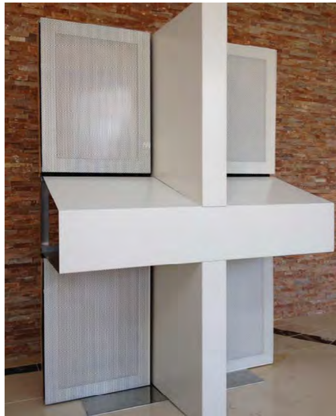
Early design involved the use of metal mesh.

Prior to commencement on-site there is intensive and continuous design development with all parties working collaboratively involving the creation of mock-ups in order to achieve the stringent architectural and building performance requirements. Pictured development work for Bristol Royal Infirmary.