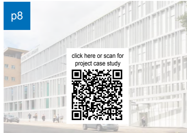
Bristol Royal Infirmary, Queens Building