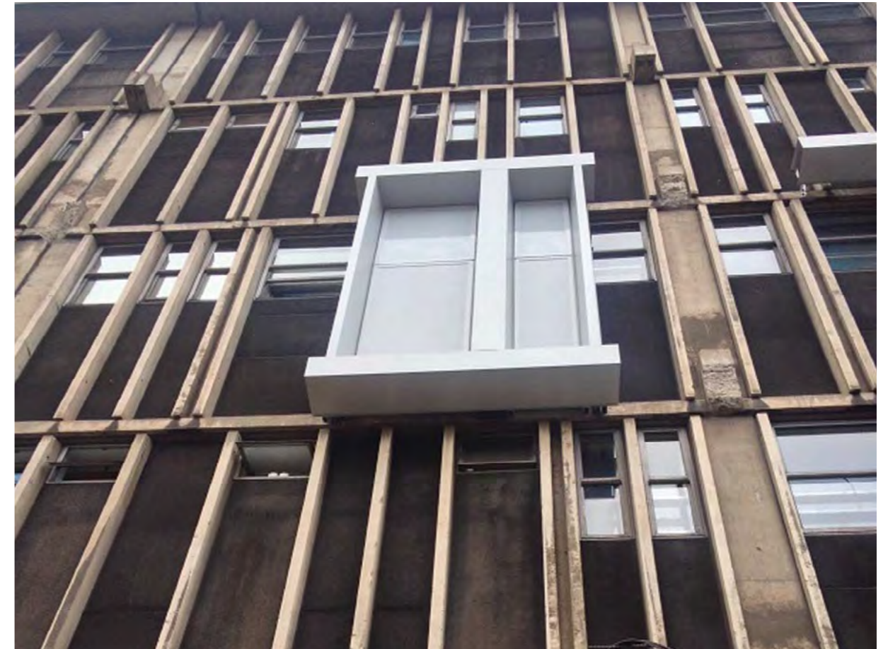
Mock-up installed on the building.