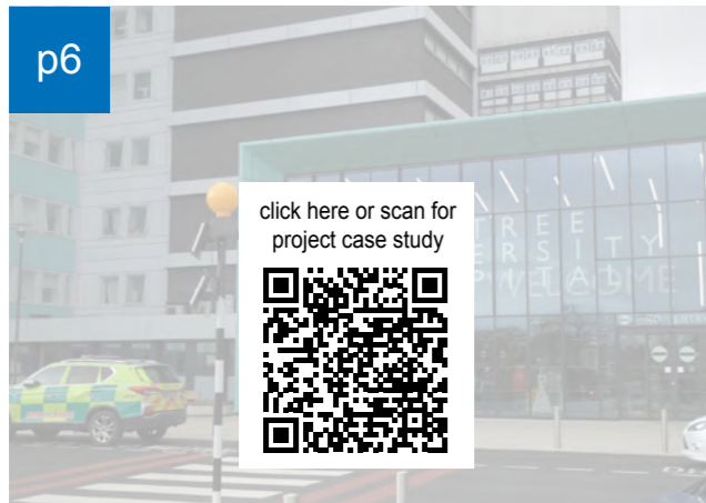
Aintree University Hospital