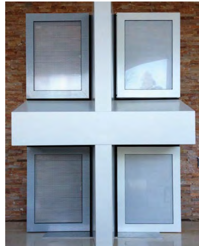
This developed into applying film to the windows.