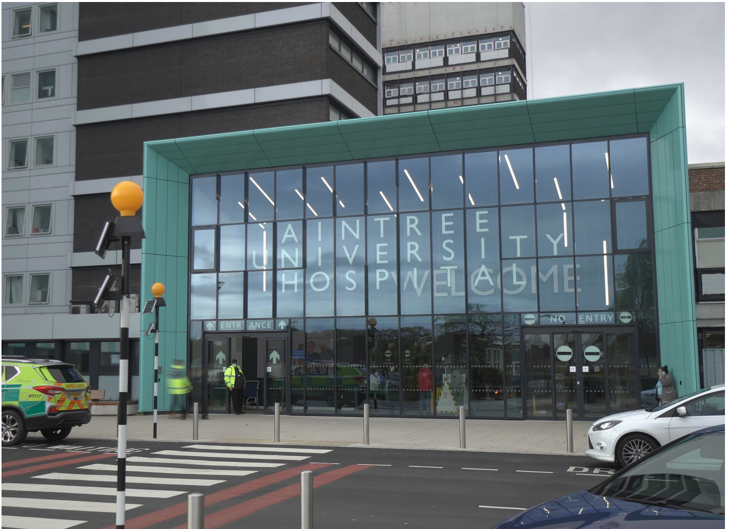
Aintree University Hospital, The Main Tower