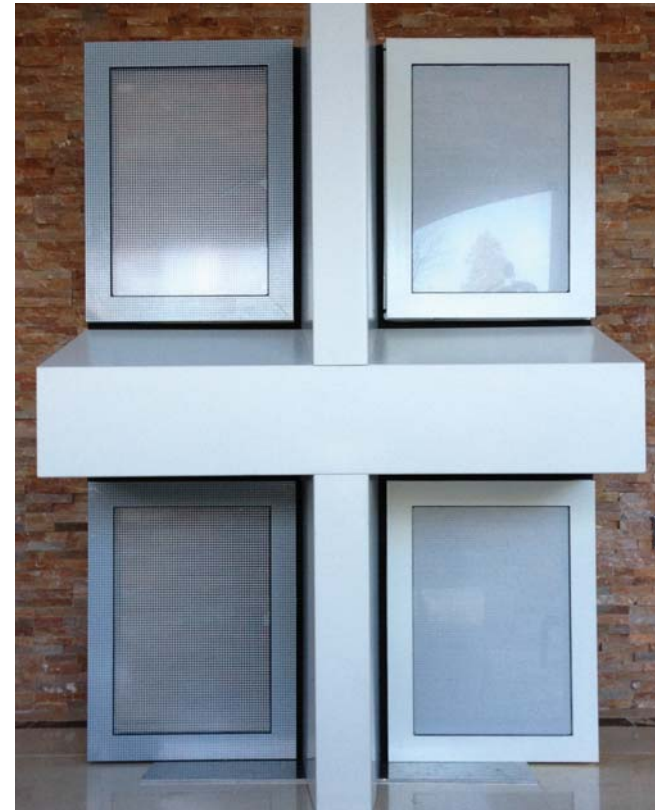
This developed into applying film to the windows.