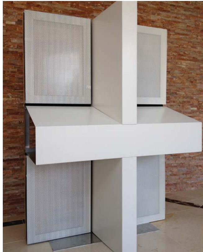
Early design involved the use of metal mesh.

Prior to commencement on-site, there was intensive and continuous design development with all parties working collaboratively involving the creation of mock-ups in order to achieve the stringent architectural and building performance requirements.