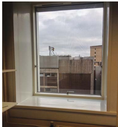
The final solution met the architectural intent that "Veil" should have no visible windows whilst meeting the performance requirement of transmittance of light internally.