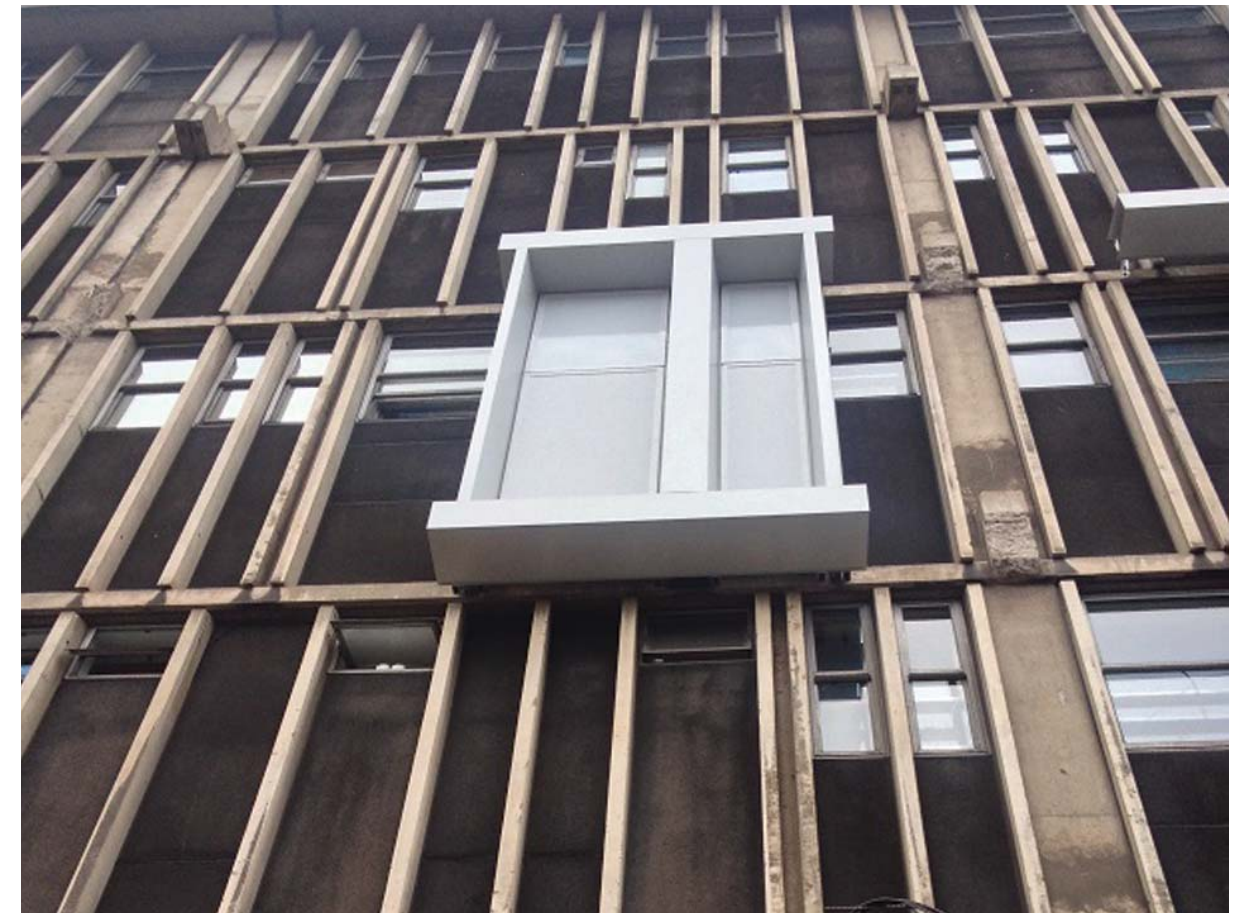
Mock-up installed on the building.