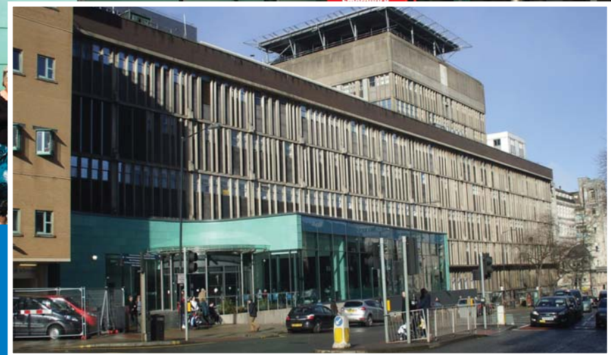
All after photos © fotohaus

T 01980 654230 E mail@dbfacades.com www.dbfacades.com